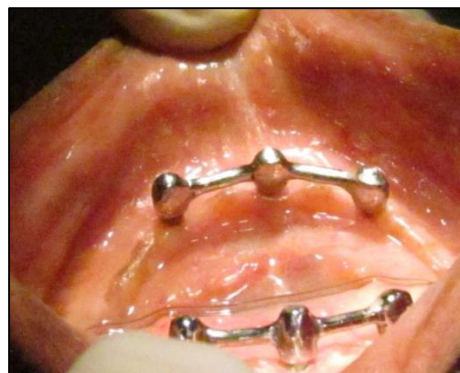
Fig.3: Bar in situ.

The next day impressions were made, lab analogs attached and the impression poured. A customized framework of copings and bar was fabricated over the analogs in self-cure acrylic resin. This framework was tried in the patient's mouth, cast, polished and tried again intraorally. The framework was cemented with dual cure resin cement (Fig.3). Retention clips and metal encapsulators were placed over the bar and then transferred to the undersurface of the mandibular denture where adequate space had been created for this attachment assembly (Fig.4). The dentures were tried and minor adjustments done. They were then finished and polished (Fig.5). The patient was trained in insertion and removal of the denture and educated in denture care. Oral hygiene instructions were given. The follow up protocol included routine checkups every month. Hygiene maintenance was regularly reinforced. The patient was extremely satisfied with her new set of dentures (Fig.6).