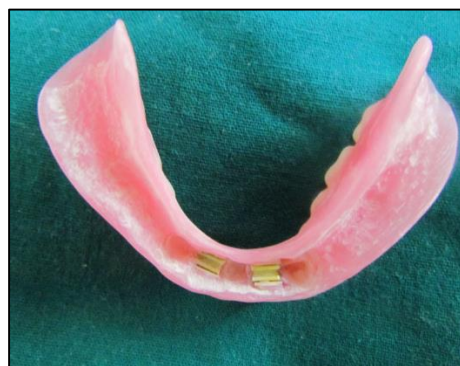
Fig.4: Metal encapsulator and retention clips transferred to denture base