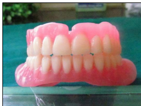
Fig.5: Dentures in occlusion