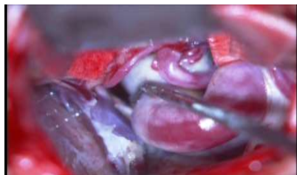
Fig. 2: Intra op image: Ball probes separated the dilated and tortuous artery from the trigeminal nerve