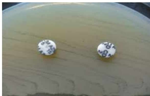
Fig. 5: R Phenotype