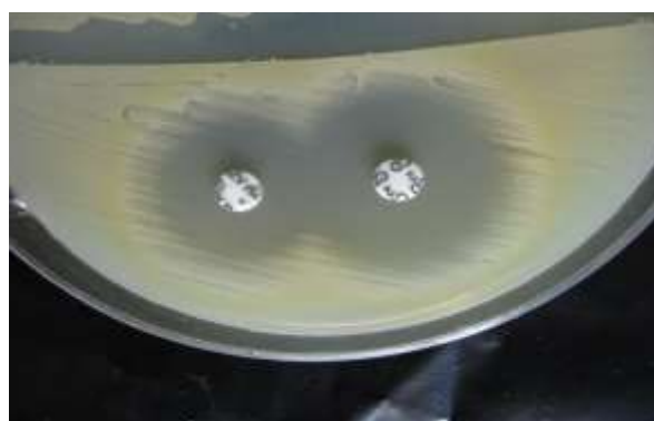
Fig. 6: S Phenotype

This shows the six phenotypes observed during CLI induction testing of S.aureus by disk diffusion. E 15 µg, ERY disc; Cd 2 µg, CLI disc.