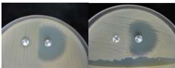
Fig. 1: D Phenotype Fig 2: D + Phenotype