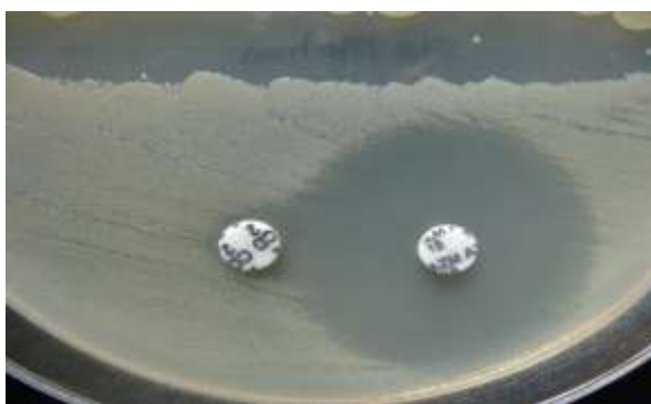
Fig. 4: Neg Phenotype