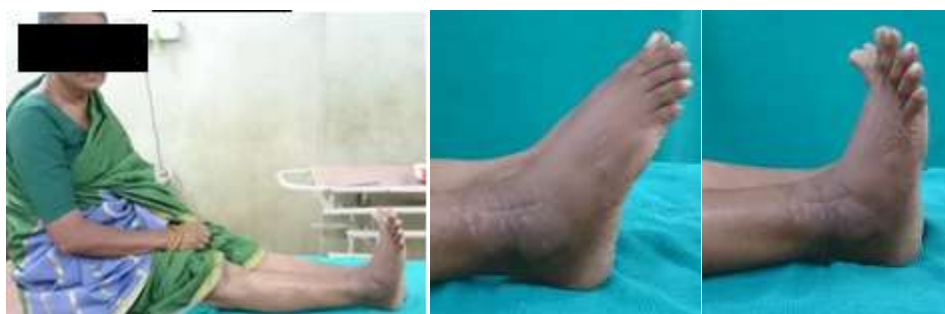
Fig. 5: Clinical picture with functional outcome