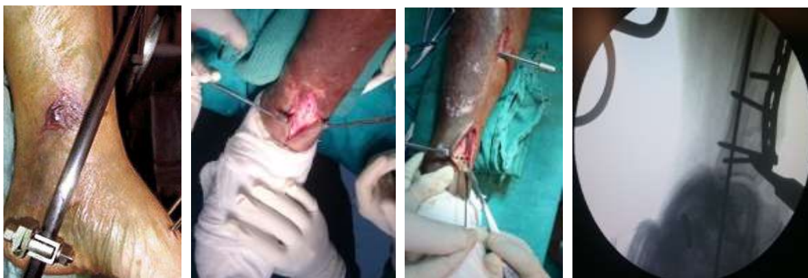
Fig. 3: Wrinkle sign, skin incision, plate introduction and intra-operative c arm image

minimum of 5-6 holes above the fracture site was selected. A submuscular plane is made using the Cobbs elevator and a pre-contoured plate was slid beneath the anterior compartment muscles and the neurovascular bundle. The proximal most hole of the plate was identified by C arm and was provisionally fixed by k wire. To achieve proper seating 3.5 mm cortical screws are applied in most cases. Later 3.5mm locking screws were applied in the sequential manner first in the distal horizontal holes and then proximal holes in alternate manner with least three screws in the diaphyseal segment. In some cases 3.5 mm cortical screws were used to achieve inter-fragmentary compression. Wound closed in layers after haemostasis over a suction drain.