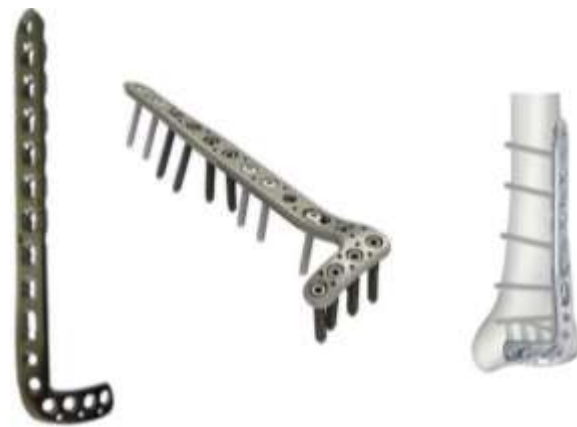
Fig. 2: Anterolateral distal Tibia LCP

Features of anterolateral LCP: The 3.5mm anterolateral distal Tibial plate is a LCP system made of stainless steel with limited-contact shaft profile. The combi-holes in the LCP shaft combine a dynamic compression unit (DCU) hole with a locking screw hole. Locking screws provide the ability to create a fixed-angle construct especially in osteopenic bone and multi-fragmentary fractures where screw purchase is compromised. Features of this include anatomically shaped, 3.6mm shaft thickness which tapers to 2.0mm distally, 60° twist in shaft is contoured for the distal Tibial anatomy, tapered tip for sub muscular insertion. Distal locking screws provide support for the articular surface, targeted locking for Volkmann's triangle and Chaput fragment.