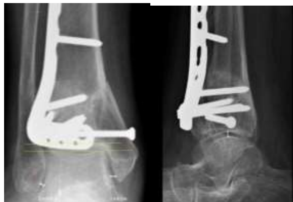
Fig. 6: Post op X ray showing Radiological alignment

The normal post-operative alignment achieved during this study was comparable to the existing studies on intramedullary nail fixation alone, i.e., Nork et al and Ehlinger et al, (9) as well as the comparative study on LCP and intramedullary nailing by Yang et al 10 and Mauffery et al. (11)