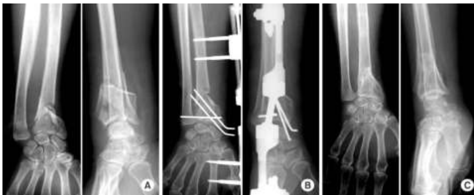
Fig. 3: A) Pre-op X ray; B) Immediate post-op x ray; C) Follow up x ray after 6 weeks