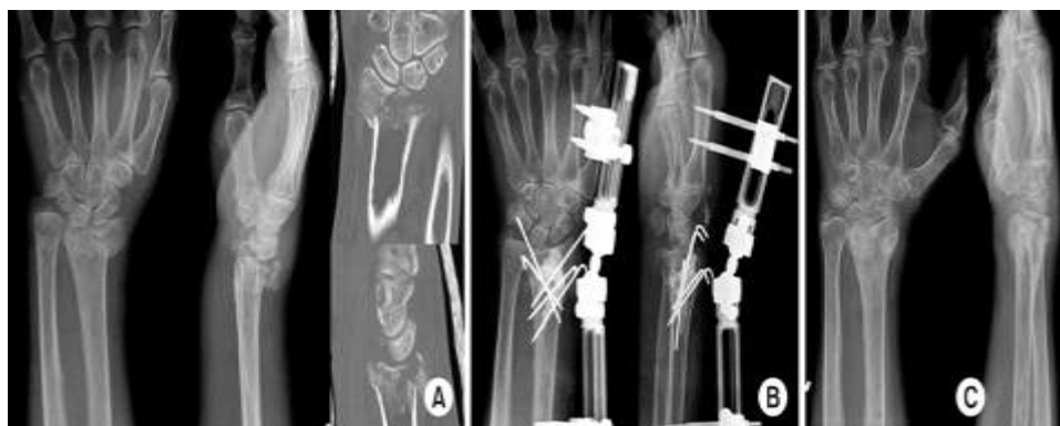
Fig. 4: (A) Pre-op x ray; (B) Immediate post op x ray; (C) Follow up x ray after 6 weeks