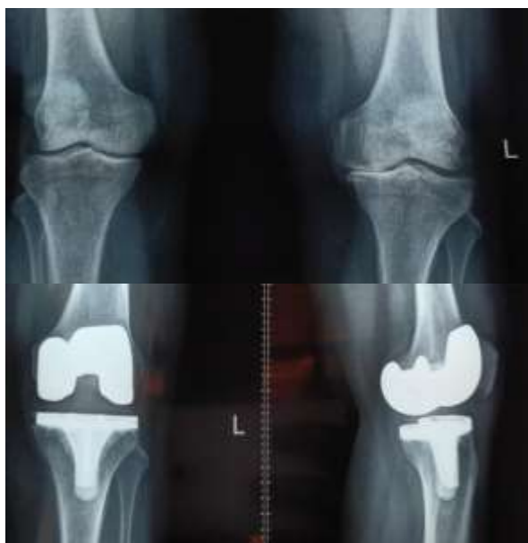
Fig. 2: Showing pre and post-operative x-ray of the same patient