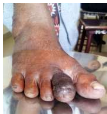
Fig. 1: Photograph showing nodular deformed soft tissue swelling of 2 nd toe of right foot

investigated biochemically and shows slight elevated serum uric acid as 8 mg/dl confirms the diagnosis at gouty tophi.