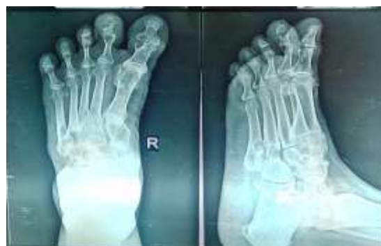
Fig. 2: Radiograph showing eroded bone, fracture and soft tissue mass of 2 nd toe of right foot