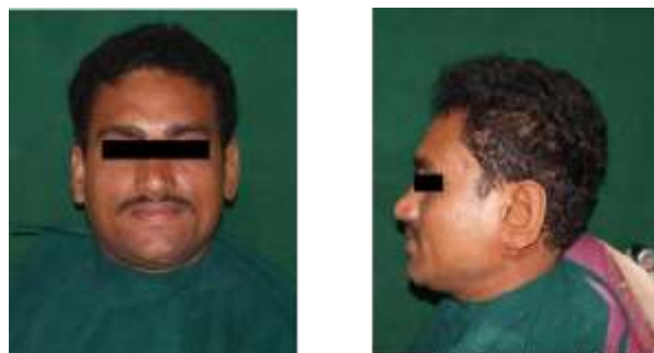
Fig. 7: Silicone ear prosthesis retained with adhesive

The final prosthesis was then tried on the patient, retention of the prosthesis was achieved by spraying skin adhesive (medical grade adhesive, cosmosil) on to the fitting surface for 1 to 2 minutes, the adhesive turns clear in color which gives the patient a sign that the prosthesis is ready to be secured. (11) (Fig. 7)