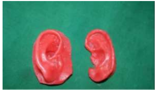
Fig. 4 (a, b): Wax pattern of contralateral & defect ear

A measurement of the patient's normal ear (right ear) was done with the calipers. The dimensions measured were the entire length of the ear, the antero-posterior dimension, the height of elevation of the pinna from the skin below the dorsal surface of the ear. The form and pattern of the helix, anti-helix, conchae and lobule. A donor ear of same dimension was chosen, an irreversible hydrocolloid, (Algitex, Dental products India) was placed on the donor ear supported by an Impression plaster to get the impression of the right ear. Melted modeling wax was then poured into the donor ear impression and allowed to cool down completely to avoid distortion. This could permit us to have a frame – work to do carving of the ear for the design of prosthesis.