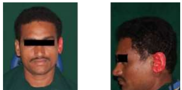
Fig. 5(a, b): Wax pattern trial procedure on patient

Two uniform layers of sodium alginate (DPI, cold mould seal) separating medium was applied on the cast of defect, the wax pattern retrieved from the alginate impression of the donor ear was placed on the same. Free hand carving keeping the contra lateral ear model as reference was done (Fig. 4, b) with an effort to simulate the same ear it was then tried on the patient face for proper orientation superior-inferiorly and antero-posteriorly. A thorough assessment was done, Checking the prosthesis both from frontal and profile views. Due consideration was given to patient feedback regarding any modification with in the pattern. The wax pattern was optimally retentive and stable on his face.