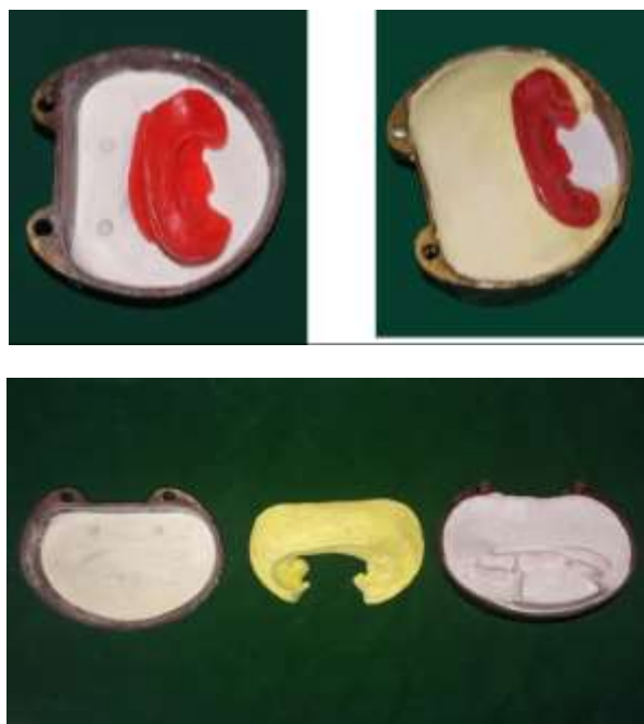
Fig. 6: Three pour flasking

Sodium alginate separating media was added and also the middle part of customized flask was poured. It was made sure that no gypsum flowed into any undercut of the wax pattern as this would cause a deformation of the pattern when removal of the middle part of the flask is attempted. Following this another modeling wax supported pour of type-II gypsum was made covering the ventral surface of the auricular wax pattern. Dewaxing procedures were performed in a very hot water bath, using the standard directions. (7) (Fig. 6)