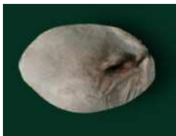
Fig. 3: Type IV gypsum cast of defect ear