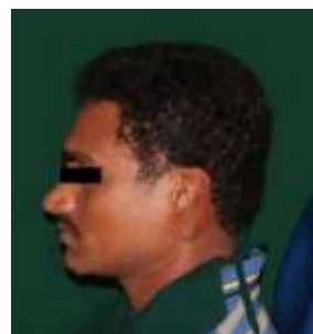
Fig. 1: Lateral view showing auricular defect

irregular and keloid surface on the left side of the head. The wound was fully healed and the surrounding skin showed no signs of inflammation and infection. (Fig. 1)