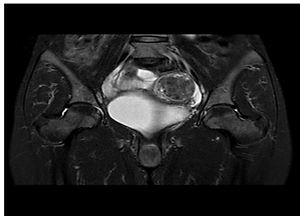
Fig. 1: MRI image showing the uterine leiomyoma with well preserved peri-tumoral planes

good and patient was discharged on 5 th post operative day.