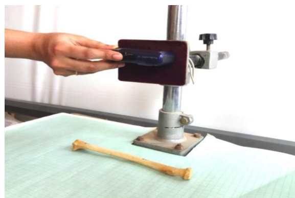
Fig. 1: Method of taking photo for neck shaft angle

Digital photographs of posterior surface of all 142(71 left & 71 right) radii were taken. Angle was measured using Image J analyser. The radii were placed on osteometric board in such a way that its posterior surface was pointing upwards. A digital camera was fixed to stand of osteometric board for proper focus and centered along with bone on the board.