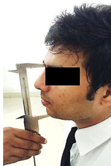
Fig. 2: Method of Taking the Facial Height