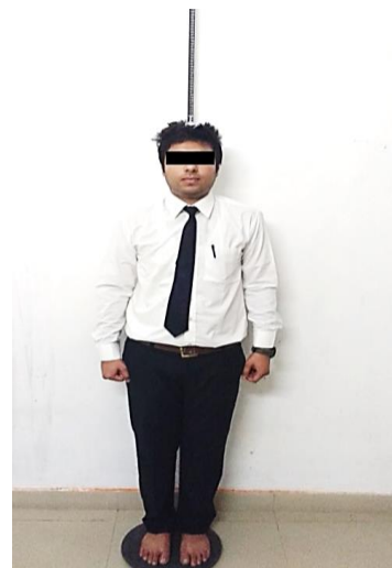
Fig. 1: Method of Measuring the Body Height

While collecting data, all the instruments were checked for accuracy and precision. The subjects were measured by the two authors separately. If a difference in reading was observed then a third reading was taken to ensure accuracy.