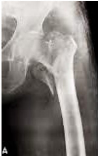
A: Pre Operative X-ray showing comminuted intertrochanteric fracture