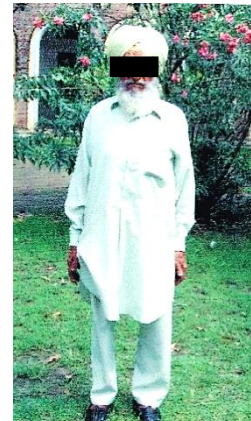
Patient showing full weight bearing