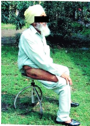
Patient showing flexion – abduction and scar mark