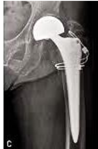
B: Post Operative X-ray after bipolar hemiarthroplasty