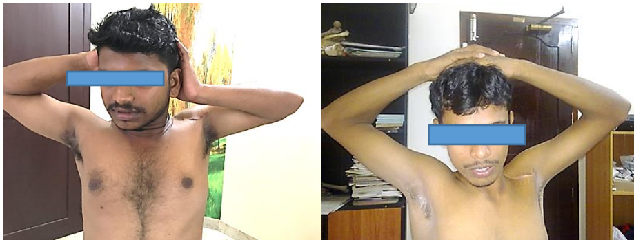
Fig. 1, 2: Post operative abduction and external rotation