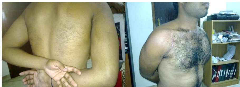
Fig. 3, 4: Post operative internal rotation