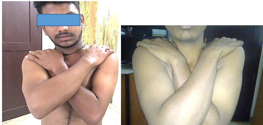
Fig. 5, 6: Post operative adduction