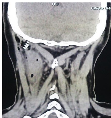
Fig. 3: Tooth perforation 5