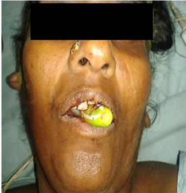
Fig. 1: Tooth perforation 1

meals and topical benzocaine gel application before meals were prescribed for 20 days.