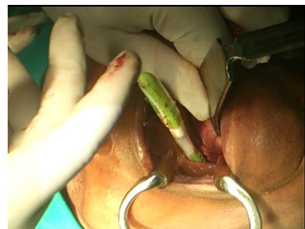
Fig. 6: Tooth perforation 8