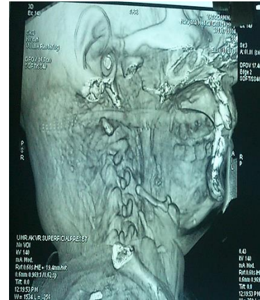
Fig. 4: Tooth perforation 6