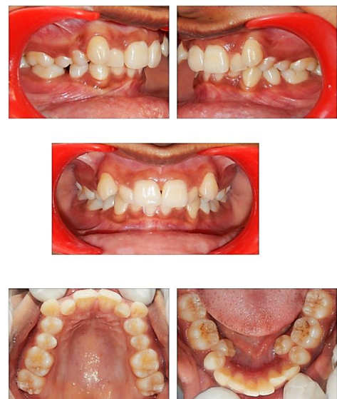
Fig. 1: Pre-treatment intraoral photographs

arch. Uprighting was planned with E-chain (from molar to lingual of premolar to canine) and open coil niti coil spring (between the canine and molar on 0.019x0.025 SS wire) to counter balance the forces of E-chain i.e. mesial force on molar and distal force on canine. lingual button was bonded on premolar to have good engagement of E-chain (Fig. 2) premolar was uprighted within 3 appointments and then finishing and detailing was done. The post treatment results are shown in Fig. 3.