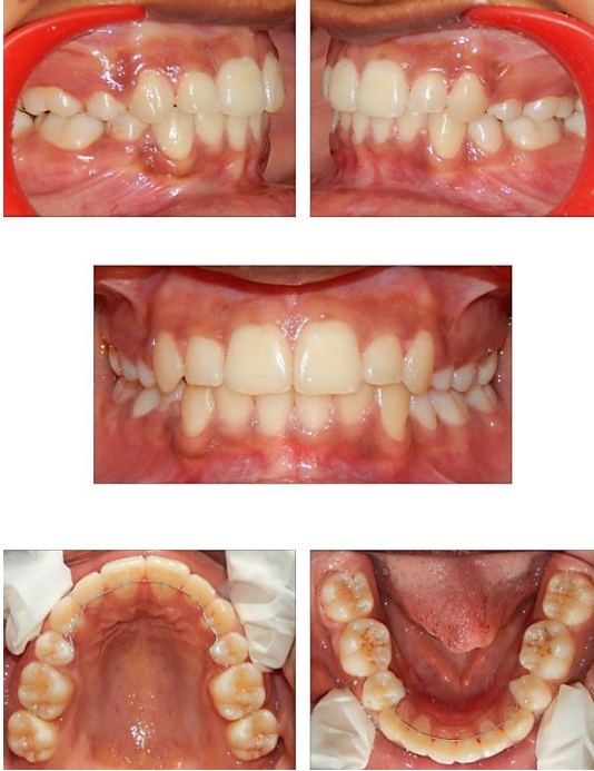
Fig. 3: Post treatment intraoral photographs