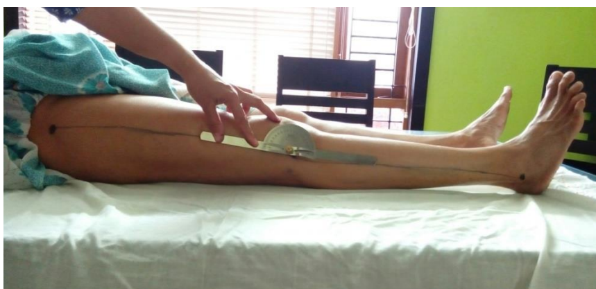
Fig. 2: Alignment of goniometer in supine position

Positioning: The fulcrum was located on the lateral epicondyle of femur. The proximal arm is associated along the line extending from lateral epicondyle to greater trochanter and the distal arm along the line extending from lateral epicondyle to lateral malleolus. The location of fulcrum is confirmed above the estimated position of the axis of motion. Fulcrum should be tuned accordingly to manage the movement changes during motion.