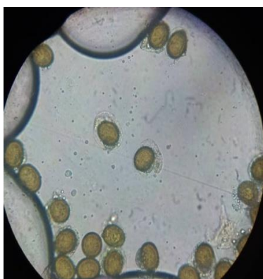
Fig. 1: Eggs of D. latum

Routine examination of stool sample showed undigested food particles and cream coloured tape-like structures, indicating some tapeworm infestation. Wet mount preparation showed the presence of large number of oval shaped, bile stained eggs, measuring approximately 70 µm×45 µm with an operculum at one end. [Fig. 1]. Typical proglottids, broader than the length, were identified. However there was no identifiable scolex. [Fig. 2]. On the basis of the morphology of the eggs with operculum and the presence of broader than long segments, the parasite was identified as Diphyllbothrium latum . Blood picture revealed hemoglobin of 9.7 g/dL and a total count of 8500/mm 3 . Differential counts were within normal limit except for eosinophil slightly raised (9%). The peripheral blood smear showed hypersegmented neutrophils suggesting megaloblastic anaemia. [Fig. 3]. She was treated with a single dose of Niclosamide 2g and follow-up stool test for ova and parasites done two weeks later were negative. Her hemoglobin level was also increased to 12 g/dL done three months later.