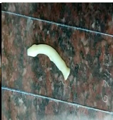
Fig. 2: Proglottids of D. latum