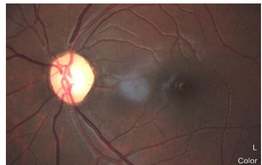
Fig. 1: Showing temporal pallor of the disc in left eye

Antibodies to aquaporin-4 was done which was negative. For the present episode, she was started on immunoglobulins and physiotherapy with symptomatic improvement. Treatment with Inj. methyl prednisolone (1gram IV OD /day for 3 days ) followed by oral tablet prednisolone 60mg was initiated along with anticonvulsant, T. Levetiracetam 500mg BD and immunosuppressant T. Azathioprine 50mg BD. Vision improved to 6/18 at the end of treatment.