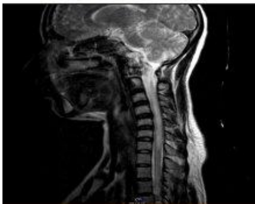
Fig. 3: Showing multiple short segment intramedullary plaques in cervical spinal cord between C2–C7 segments