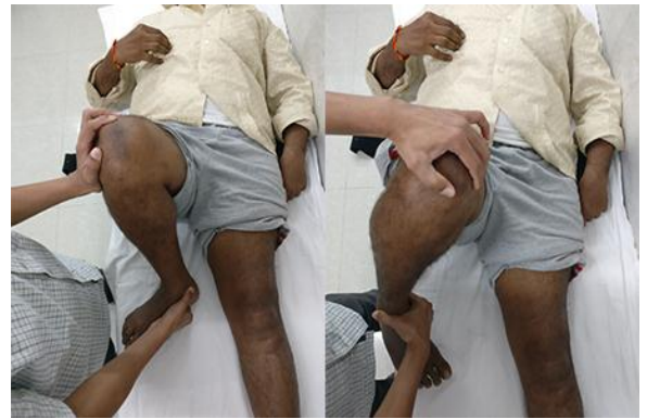
Fig. 3: Clinical demonstration of McMurray's test

No symptoms of meniscal tears were observed in 32 of the 34 cases (Table 1) in their last follow-up which also included 3 cases of meniscal repair done in the white-white zone. Hence, 94% cases were considered as clinically healed. Of the other two cases, one patient had joint line tenderness, and the other had a positive McMurray's test (Fig. 3) during follow-up. None of the patients had any locking episodes. The overall Lysholm score increased to a mean value of 95.2 as compared with the preoperative mean value of 61.5 ( p < 0.0001 ). In 9 cases where isolated meniscal repair was done, the Lysholm score on an average increased to 97% postoperatively from a preoperative score of 65.8% (Table 2). In the 25 cases where ACL reconstruction was combined with meniscal repair, the Lysholm score increased from 60.0% preoperative to 94.5% postoperative (Table 3).