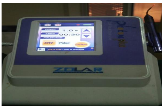
Fig. 2: Diode Laser