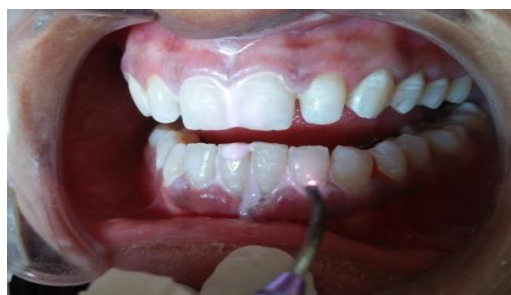
Fig. 6: Laser application w.r.t. 31, 32, 41, 42