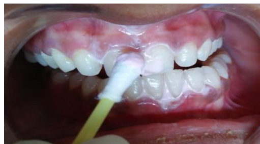
Fig. 5: Paste applied with cotton swab