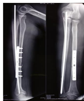
Fig. 2d: Group D

In plating we used 7 hole LCDCP plate with 3 screw both proximal and distal to fracture site. 2