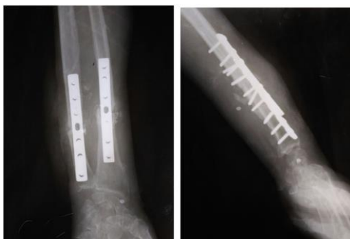
Fig. 2a: Group A