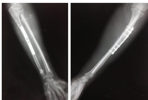
Fig. 2c: Group C