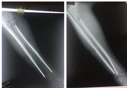
Fig. 2b: Group B