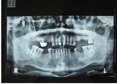
Fig. 3: OPG