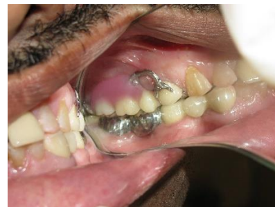
Fig. 11: Post treatment left side