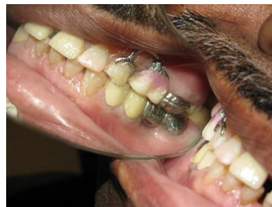
Fig. 10: Post treatment right side