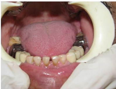
Fig. 5: Fixed prosthesis in lower arch