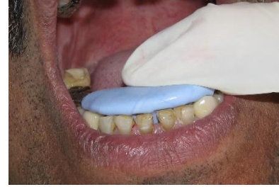
Fig. 8: Index for composite build up