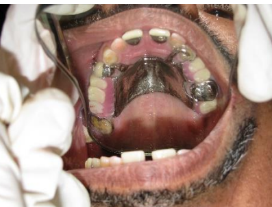
Fig. 7: After Prosthesis- Maxillary arch