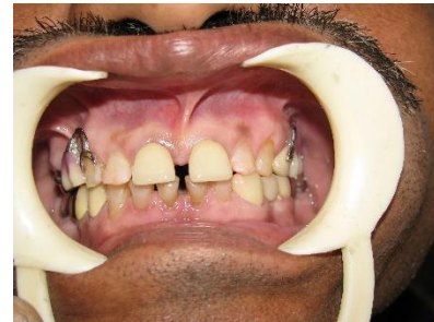
Fig. 9: Post treatment frontal view