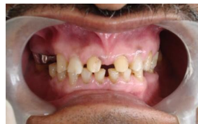
Fig. 1: Pretreatment frontal view

Oral hygiene motivation was ensured and patient called for needed follow-ups. Patient was found to be comfortable and happy, occlusion was reevaluated, and hygiene found to be acceptable.