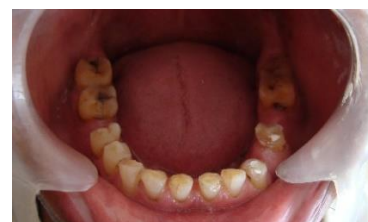
Fig. 2a and 2b: Pretreatment occlusal view