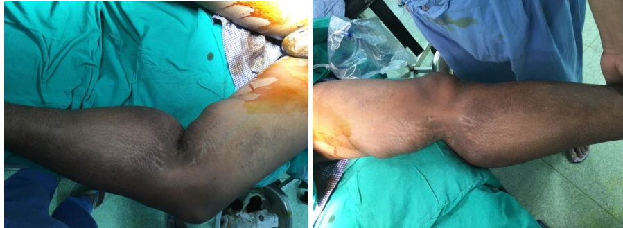
Fig. 7: Swelling over postero-medial aspect of left thigh and proximal leg