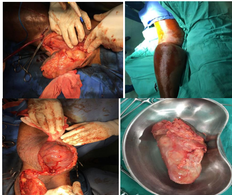
Fig. 9: Marginal excision of the mass