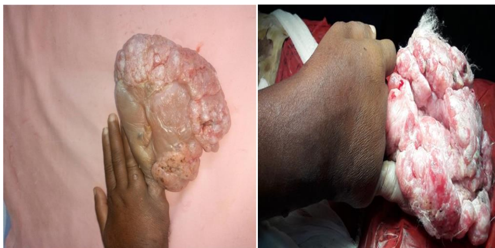
Fig. 1: Picture depicting fungating mass over little finger of right hand

This case was managed with ray amputation of right little finger from shaft of 5 th metacarpal and excision of swelling from subcutaneous plane right forearm along with other cutaneous lesions. (Fig. 5, 6) Histopathology report showed sporangia of various shapes and sizes representing different stages of maturation.