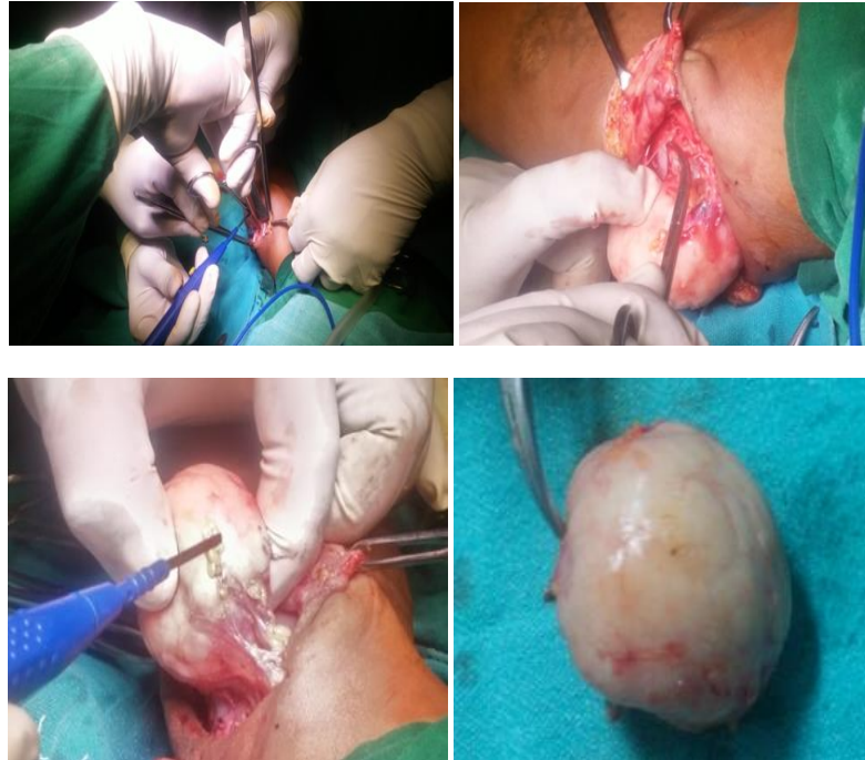
Fig. 5: Excised cutaneous mass from right forearm