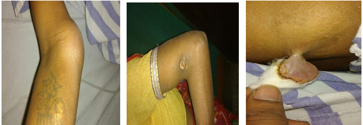
Fig. 2: Musculoskeletal swelling of forearm