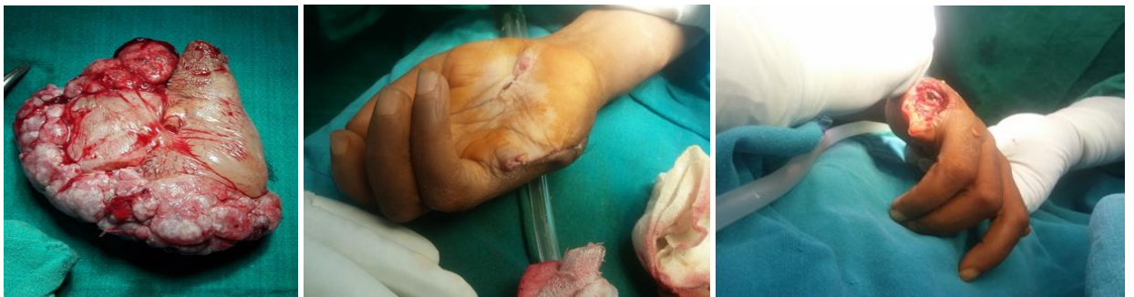
Fig. 6: Excised fungating mass along with right little finger from right hand