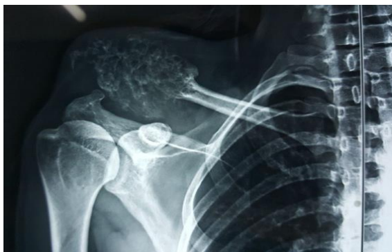
Fig. 11: Radiograph showing destruction involving the of the right clavicle