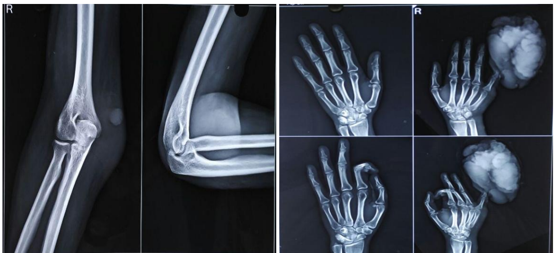
Fig. 4: Radiograph showing osseous involvement and soft tissue shadow