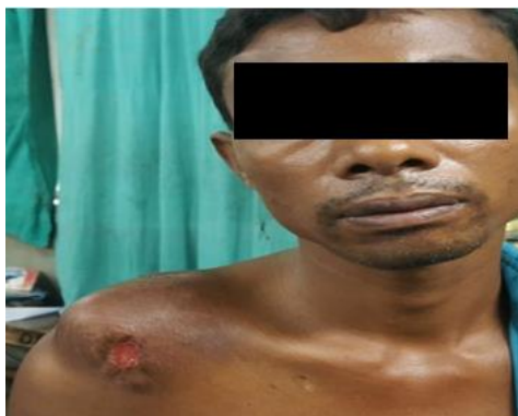
Fig. 10: Clinical picture of swelling over right shoulder

Histopathological examination of the lesion revealed many sporangia & spores with presence of lymphocytes and multinucleated giant cell. PAS stained smear showed many sporangia and spores along with giant cell suggestive of rhinosporidiosis. Isolated involvement of clavicle bone is rare in rhinosporidiosis. Dapsone is the drug in the doses of 100 mg OD for 6 months that is regarded as useful for treating rhinosporidiosis.