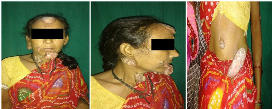
Fig. 3: Clinical picture depicting face and abdomen with multiple swelling with ulceration