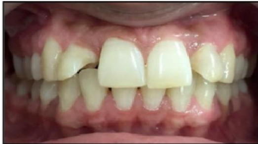
Fig. 1: Preoperative intraoral photograph