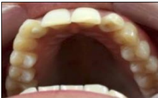
Fig. 3: Zirconia and fiber placement (clinical)