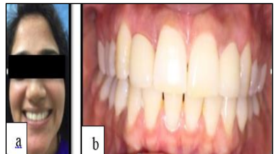
Fig. 6(a): Post treatment extra oral photograph; (b) Post Treatment intraoral Photograph