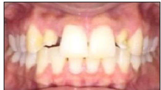
Fig. 5: Teeth preparation