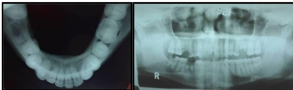
Fig. 2: Occlusal and panoramic images