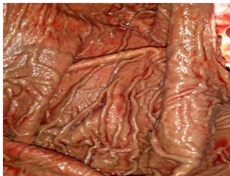
Fig. 2 Stomach mucosa thickening with brownish discoloration