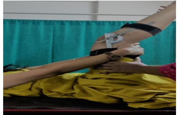
Fig. 2: End position of active knee extension test (AKET)

KED angle was measured by universal goniometer (Fig. 3). The subjects having bilateral hamstring tightness of 20 degrees or more were included in the study. Any history of low back pain within last 3 weeks, history of lower limb injury within last 6 weeks, hypermobility at knee joint/joints, history of hamstring tear, history of any orthopedic surgery of lower limb within last 6 weeks and subjects with any neurological disorder were excluded from the study. The study was conducted in duration of 4 months.