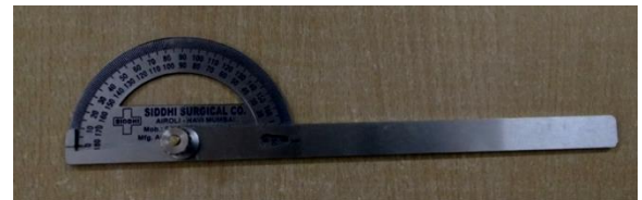
Fig. 3: Universal goniometer

KED angle was measured by universal goniometer (Fig. 3). The subjects having bilateral hamstring tightness of 20 degrees or more were included in the study. Any history of low back pain within last 3 weeks, history of lower limb injury within last 6 weeks, hypermobility at knee joint/joints, history of hamstring tear, history of any orthopedic surgery of lower limb within last 6 weeks and subjects with any neurological disorder were excluded from the study. The study was conducted in duration of 4 months.