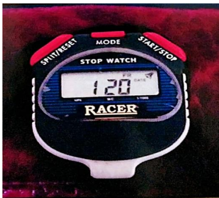
Fig. 5: Stopwatch