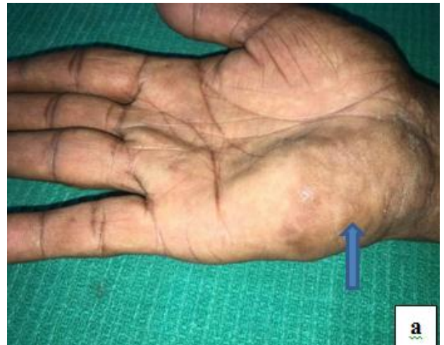
Fig. 1: a. hyperpigmented plaque on the right (blue arrow).

A solitary, well defined, hyperpigmented plaque of 5x3cm size present over the hypothenar eminence of Right palm. Plaque was tender, firm, cold, and incompressible with intact sensation. Amputated index finger following trauma on the left hand as shown in figure 1(b). Hair, nail, oral mucosa, genitals were normal and systemic examination was also normal.