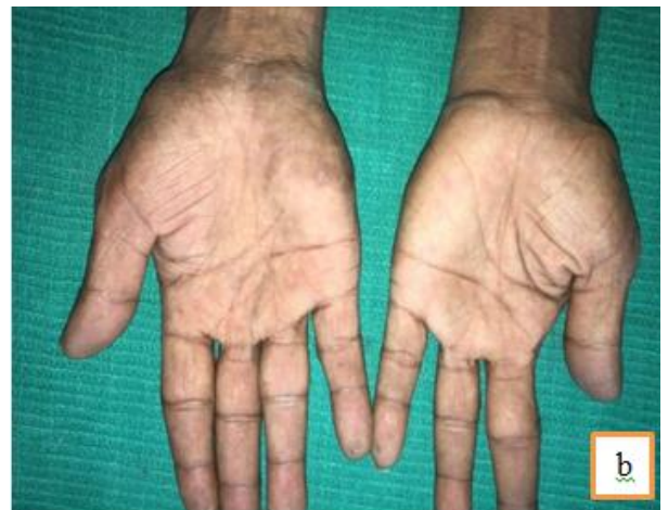
Fig. 1: b. Comparison with the normal left hand (note the amputated index finger on the left).

Clinical differential diagnosis were Glomus tumor, Tufted angioma, Blue bleb rubber nevus, Eccrine nevus, Hansen's disease (due to amputated finger).