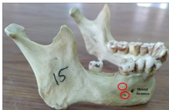
Fig. 5: Two accessory mental foramina (circled) found postero-superior and postero-inferior to main mental foramen