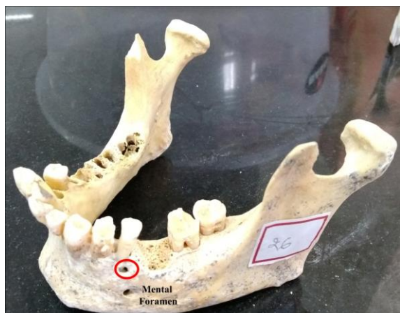
Fig. 4: Accessory mental foramen (circled) found antero-superior to main mental foramen near the canine root