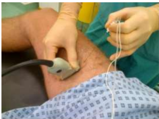
Fig. 1: Patient positioning in adductor canal approach

In our study, the NRS static and dynamic Scores among the patients of ACB group were significantly lower than the NRS static and dynamic scores among the patients of conventional group at 1 st , 2 nd , 4 th , 8 th , 12 th , 20 th and 24 th hour postop, whereas the pain scores were not significant at postop (0 mins), 30min and at 16 th hr. (Table 2 and 3). Similar results have been found in studies conducted by Jin SQ et al, 16 Jenstrup MT et al 17 and Grevstad U et al, 18 where the authors have documented that the adductor canal block resulted in significantly lesser dynamic and static pain scores among the patients undergoing total knee arthroplasty.