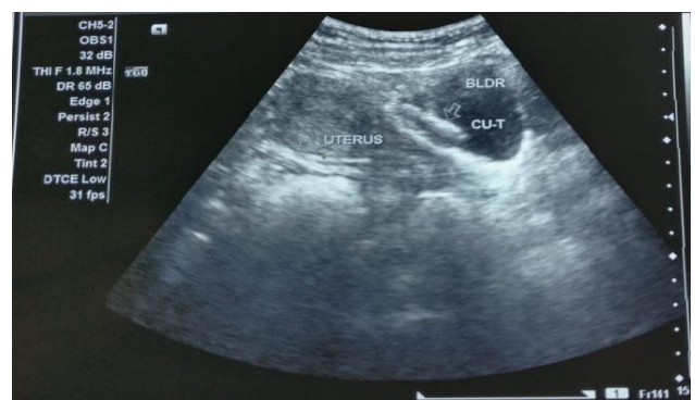
Fig. 1: Sonographic image showing IUCD inside bladder

imaging, cystoscopy was done, which showed one centimetre of IUCD in the posterior bladder wall away from ureteric orifice (Fig. 2). IUCD was removed by endoscopic forceps. No perforation appreciated in bladder wall. As the woman wanted permanent method of contraception, laparoscopic sterilization was done. In order to facilitate complete healing, an indwelling, transurethral Foley's catheter was placed for twenty-one days. Post-operative period was uneventful. On follow-up, there were no urinary complaints.