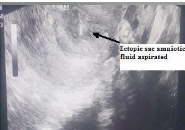
Fig. 3: Aspiration of amniotic fluid