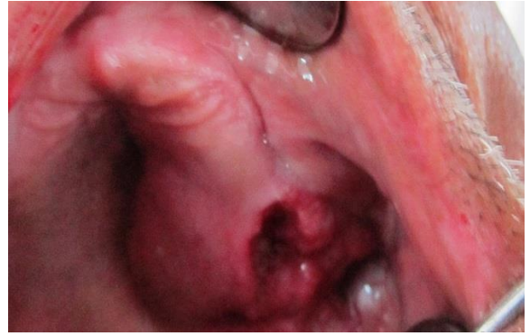
Fig. 2: Clinical presentation with Intraoral view