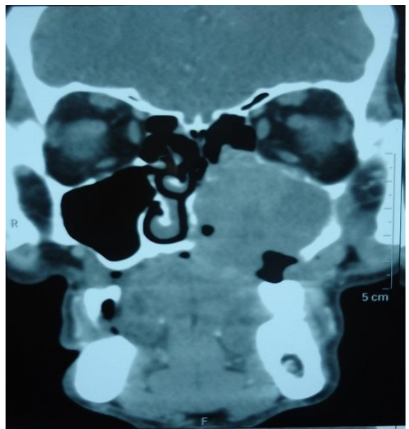
Fig. 4: Computed tomography